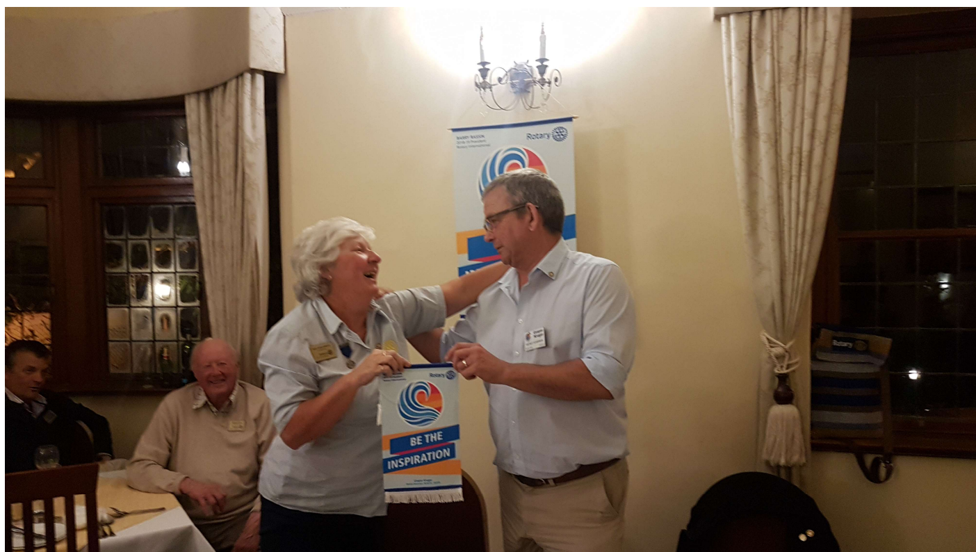
Yup, our President is inspired!