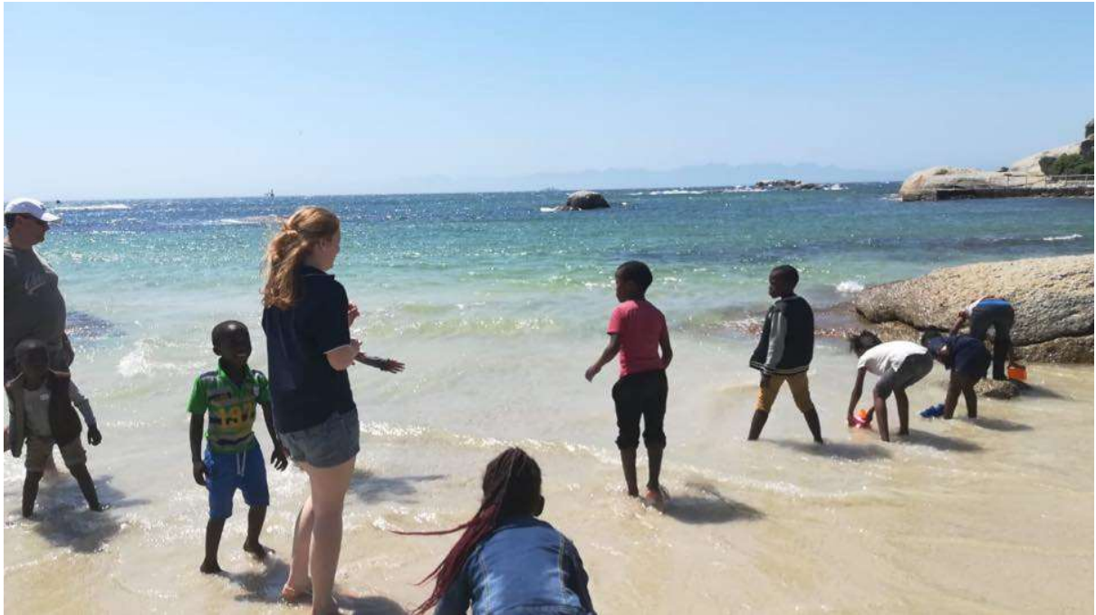
Kids' Day Out