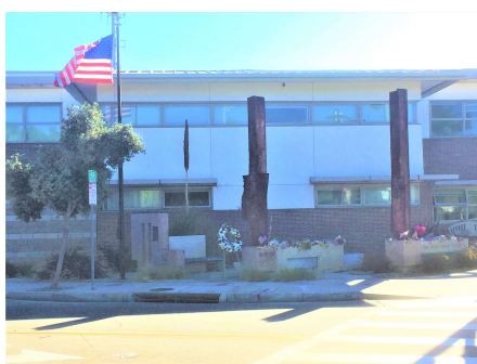
Fire station with steel beams in front