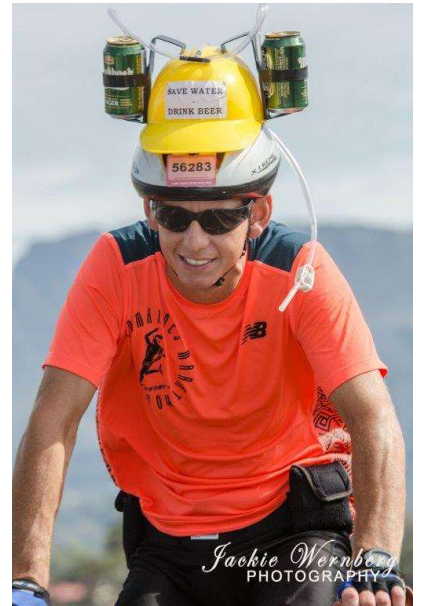
Taking Cape Town's message to the world

...and a couple of the guys who kept them all safe