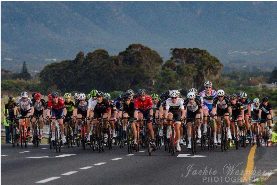
A small sample of the 35 000 competitors