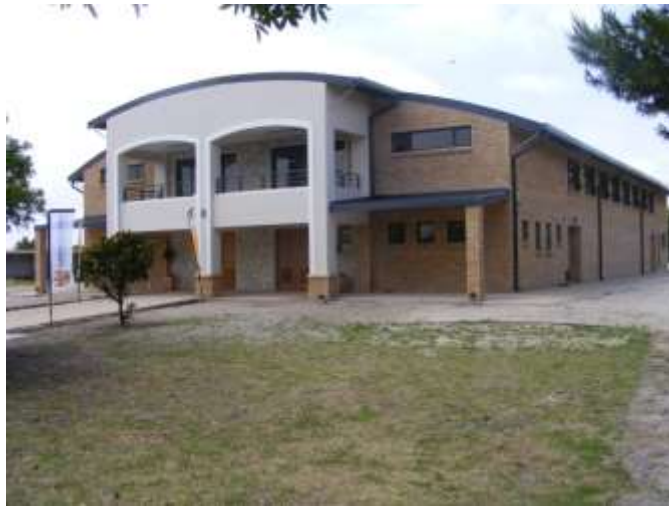
A similar hall built by the Archway foundation for a school in Cape Town.

We are planning to put up an honour board in the hall, listing all our partners in this milestone for the school.